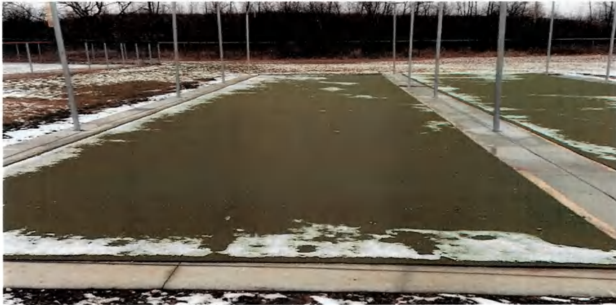
Another Beacon Athletics, Midwest project utilizing the same modular tension cage Jr. Chargers are proposing