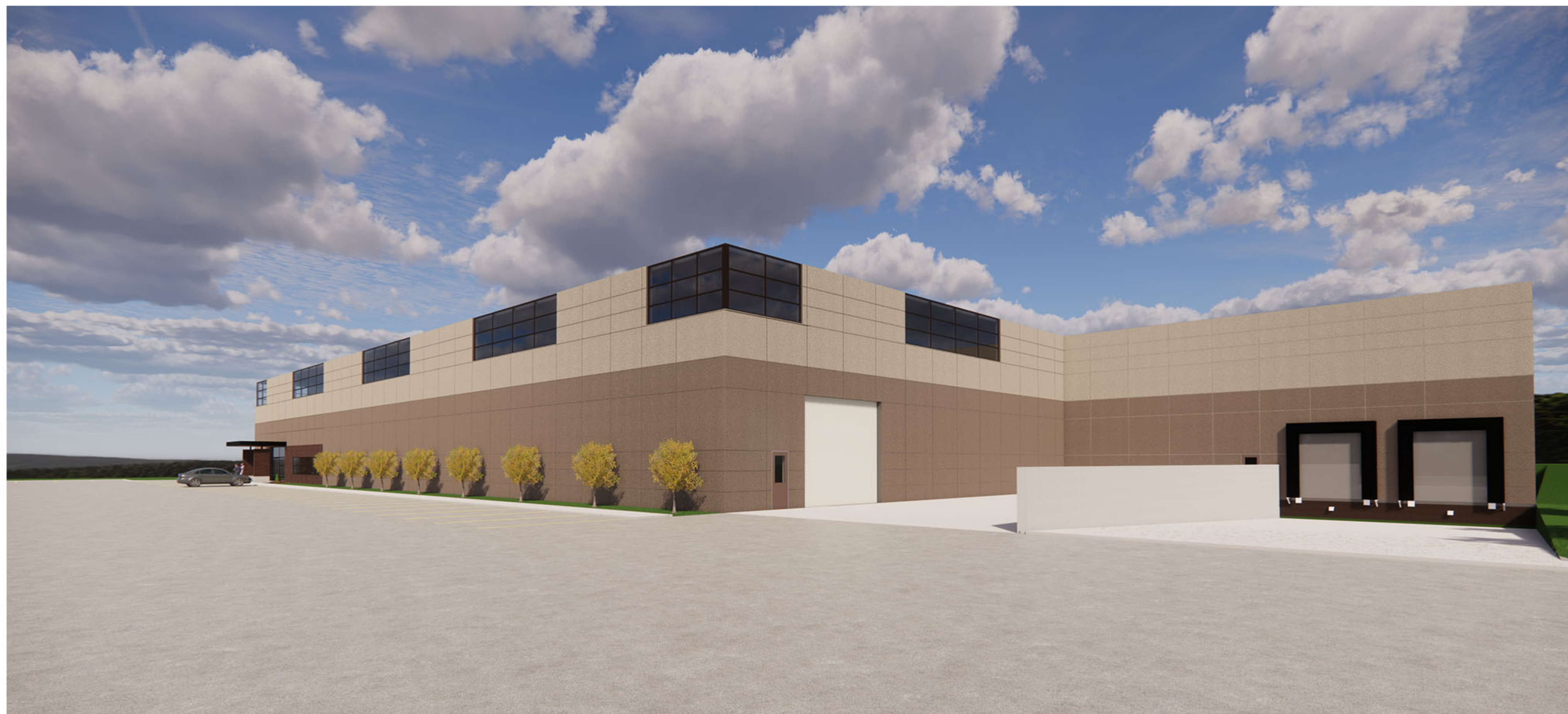
SOUTH EAST PERSPECTIVE