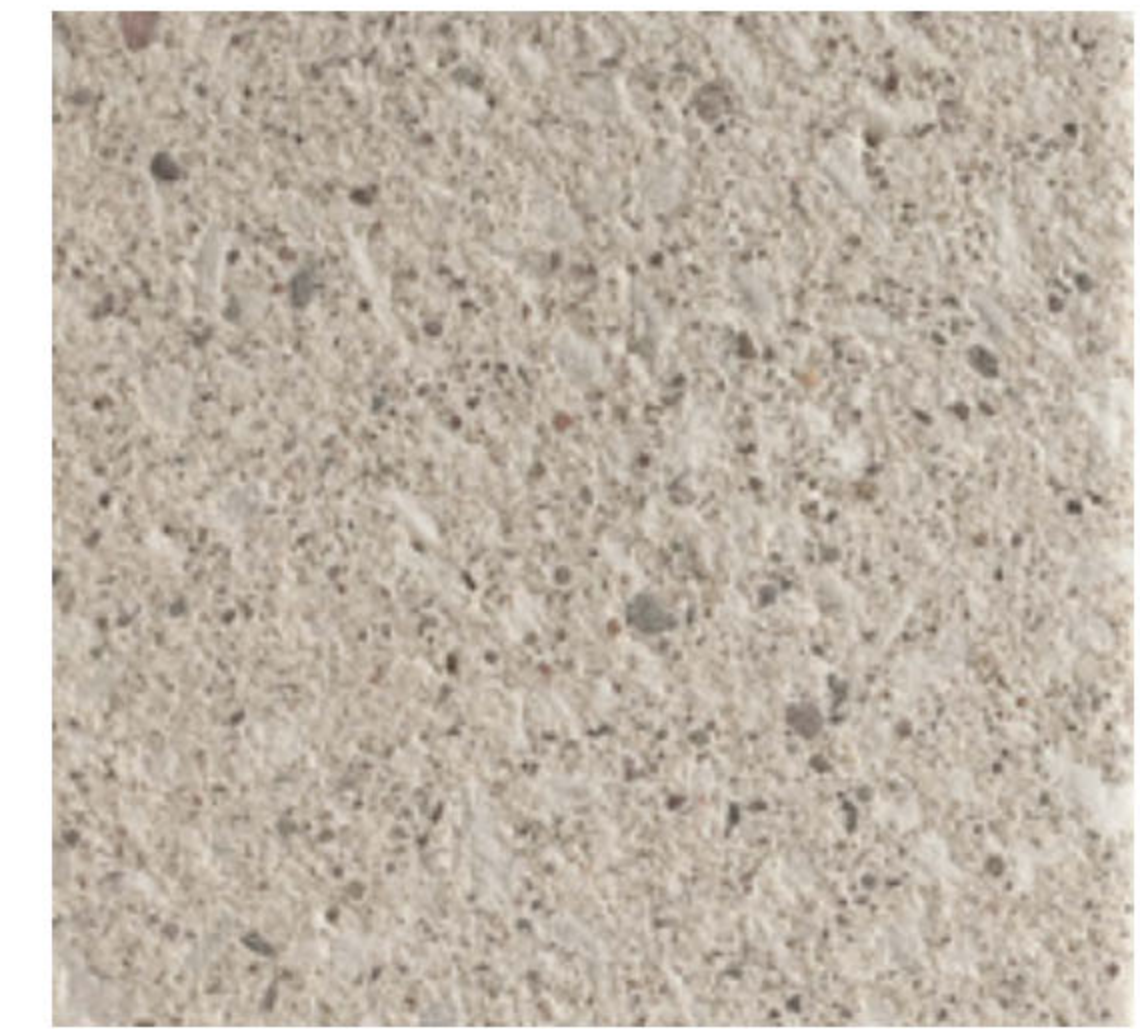
PRECAST PANEL UPPER COLOR