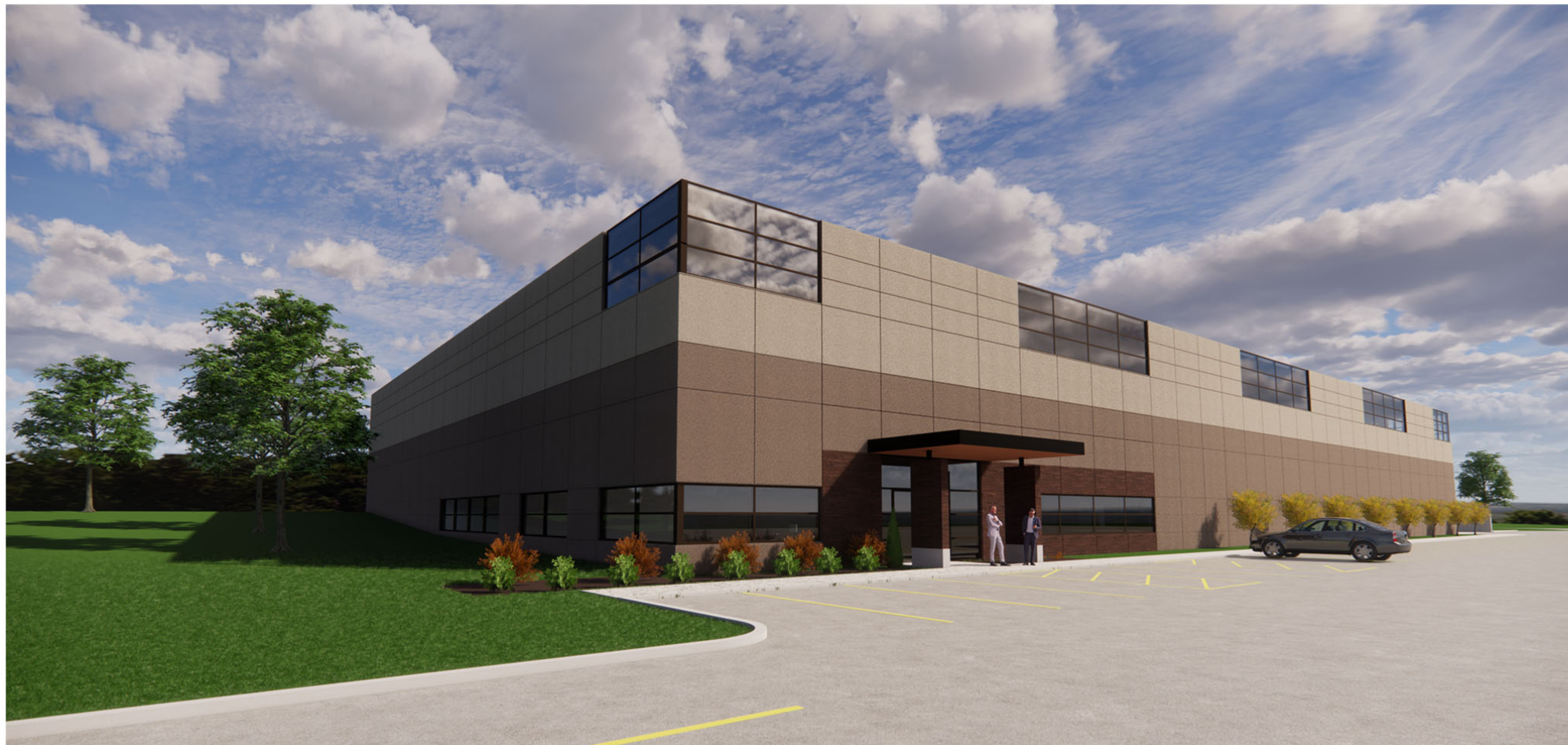
SOUTH WEST PERSPECTIVE