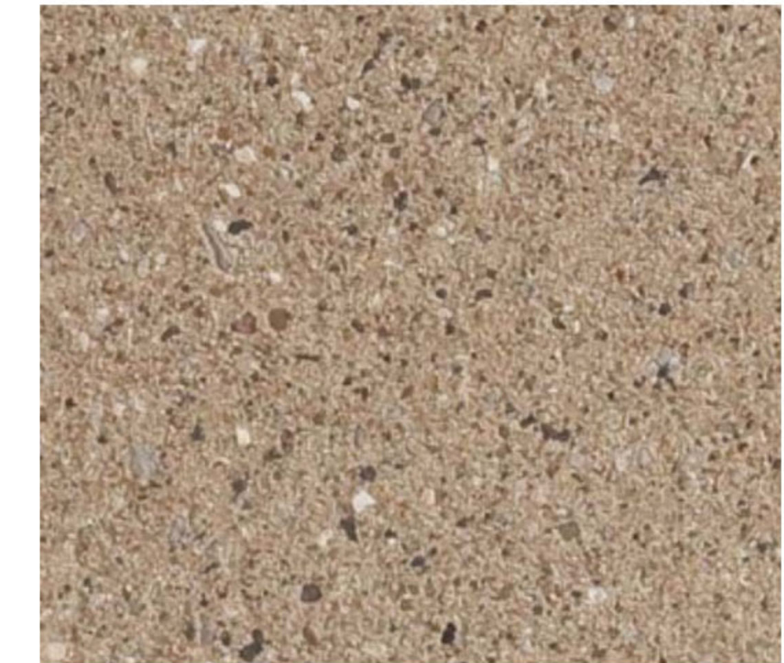
PRECAST PANEL LOWER COLOR