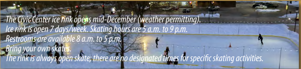
The Civic Center ice rink opens mid-December (weather permitting). Ice rink is open 7 days/week. Skating hours are 5 a.m. to 9 p.m. Restrooms are available 8 a.m. to 5 p.m. Bring your own skates. The rink is always open skate; there are no designated times for specific skating activities.