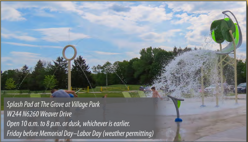
Splash Pad at The Grove at Village Park W244 N6260 Weaver Drive Open 10 a.m. to 8 p.m. or dusk, whichever is earlier. Friday before Memorial Day–Labor Day (weather permitting)